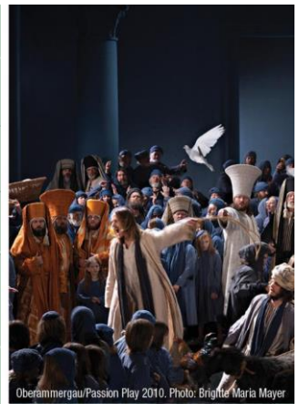
Oberammergau/Passion Play 2010.

9 Days • 13 Meals: 7 Breakfasts, 1 Lunch, 5 Dinners